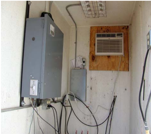
Here is the second picture