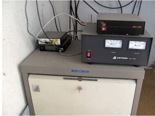
Here's the first picture inside.