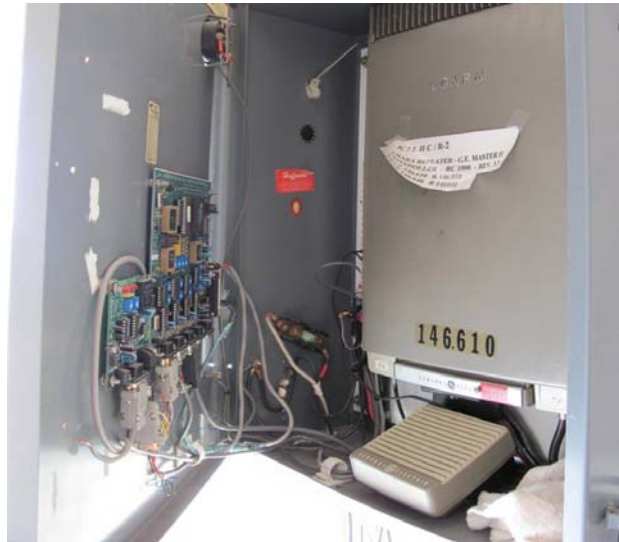
Here is the third picture - This is the insides of the .620 machine. I remember building this repeater sometime back in the early 90's. Looking at it was like looking at an old friend. As I recall, the enclosure came from some old equipment we had retired at work. I gutted out the box and installed an old GE Master 2 the club had acquired up at Tuthill. I spent a couple of Saturdays converting the radio for two meter use and wiring it up in this box. The only 'new' thing I see here is the controller. I would guess that the controller has been changed out several times over the years.