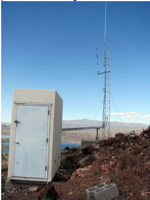
This is another view of the building and tower.