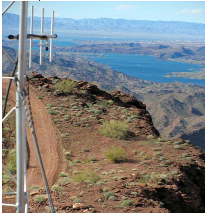
This is the 440 link shooting back up to Havasu.