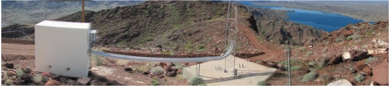
This is a panoramic view of the club's building and tower. This is a 'raw' mosaic of a series of several photos. We're looking North towards Lake Havasu City.

I was up at Black Metal Mountain yesterday working on one of my sites. I also took some photos of the club's stuff.