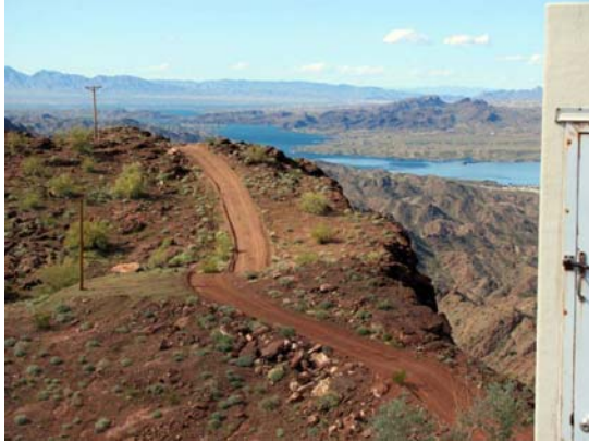
Here's another telephoto shot looking North towards Lake Havasu City. The repeater building is on the right.